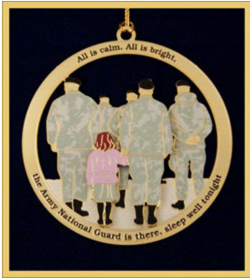
The 2006 Army National Guard Keepsake Ornament